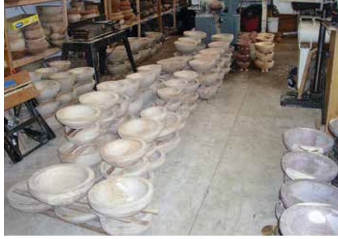
Bowl blanks, mostly Spanish chestnut, air-drying in Dale's shop.