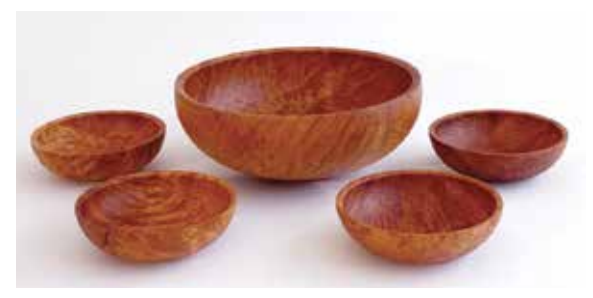
Salad Bowl Set, 2010, Pacific madrone, largest: 5" \times 121/2" (13cm × 32cm)

This set has been used one to two times per week for nine years and still looks new. Great form and spectacular figure.